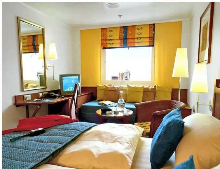
Exterior Cosmos XC Cabin